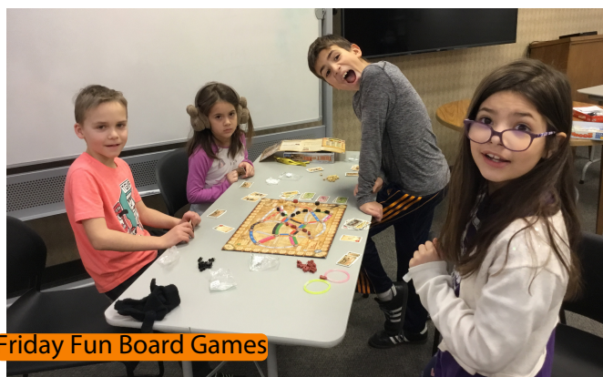
Friday Fun Board Games