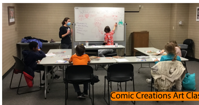
Comic Creations Art Class