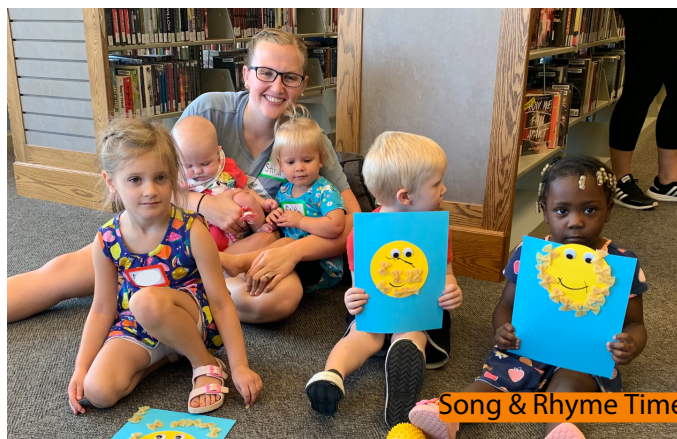
Song & Rhyme Time

Tuesdays at 9:30 a.m. (1/25-3/29) - Ages 3-6