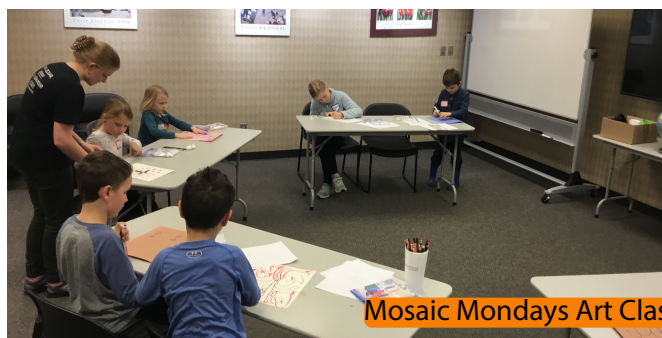
Mosaic Mondays Art Class

*Register for events at orangecitylibrary.org .