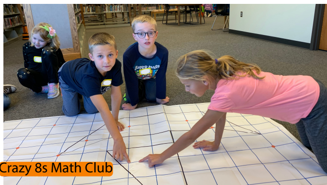
Crazy 8s Math Club